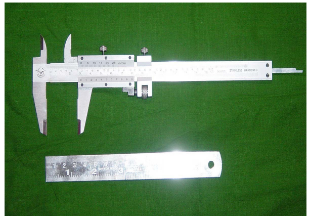
Fig 1: Materials Used for Study Instruments Used: Vernier Caliper And Metallic Scale

Intraobserver variation was avoided by measuring each reading three times by each of the three investigators and mean of the three readings were taken as final value and recorded.